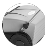
Quick stop mechanism of the handlebar