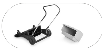
Large dirt container