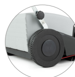
Large rear wheels