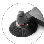
Adjustable side brushes