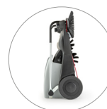
Compact dimensions: easy to store