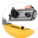
Removable lid + floater + motor protection filter