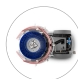
Compact squeegee: perfect drying performance even in curve