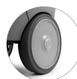
Large diameter non-marking wheels