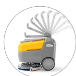
Adjustable and tiltable handle