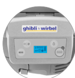
Control panel with display