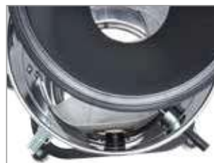
CONVEYOR CONE WITH COLLECTING BAG