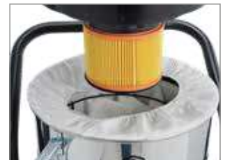
HEPA H14 CARTRIDGE AND CONDUCTIVE PREFILTER