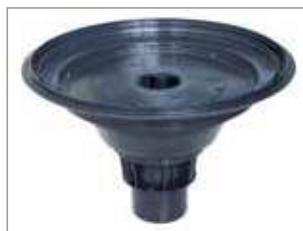
FLOATER FOR LIQUIDS AND SAFETY MESH