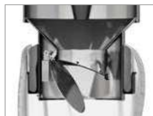
SELF DISCHARGE VALVE WITH BEST SEALING