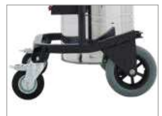
LARGE REAR WHEELS WITH TYRES FOR WORKING ON UNEVEN SURFACES