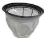
CLASS M STAR-SHAPED FILTER