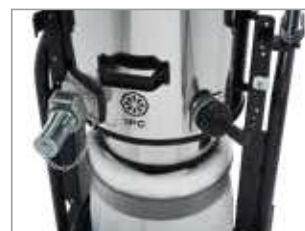
MANUAL FILTER SHAKER