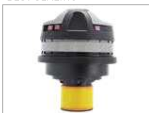
HEPA 14 CARTRIDGE