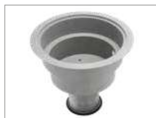
INTERNAL FILTER CHAMBER WITH PROTECTED FLOATER