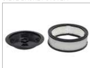
WASHABLE CLASS M CARTRIDGE