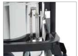
FULL TANK INDICATOR