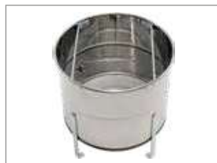
FLOATING & ANTI-BLOCK SIEVE BASKET SYSTEM